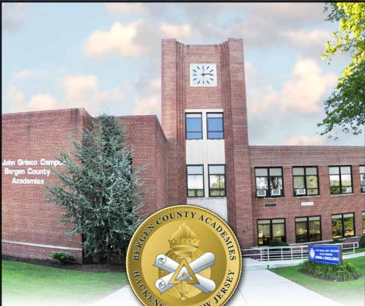
John Grieco Campus Bergen County Academies

AEDT • ABFIB • ACAHA • AMST • ATCS • AVPA • AAST • AEDT • ABFIB